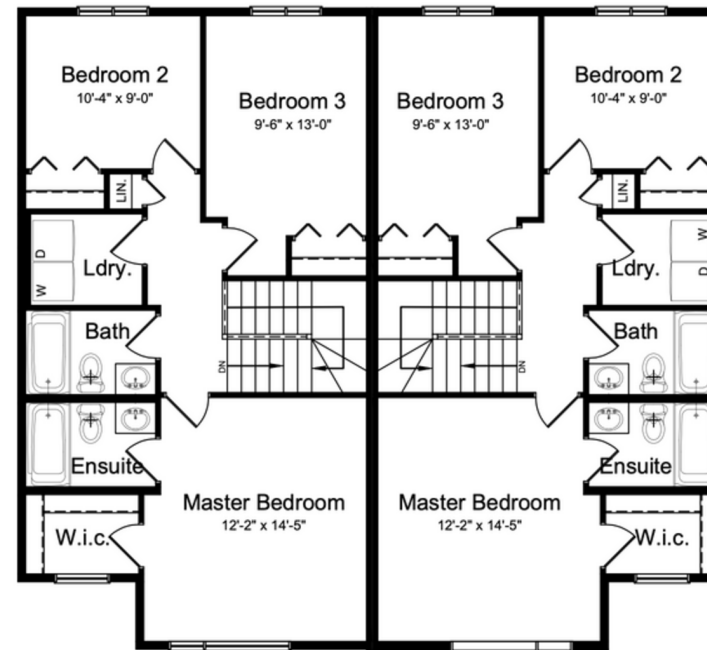
Upper Floor Plan ~ 770 sq. ft. ea. unit