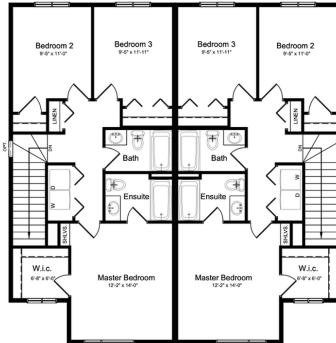
Upper Floor Plan ~ 785 sq. ft. ea. unit